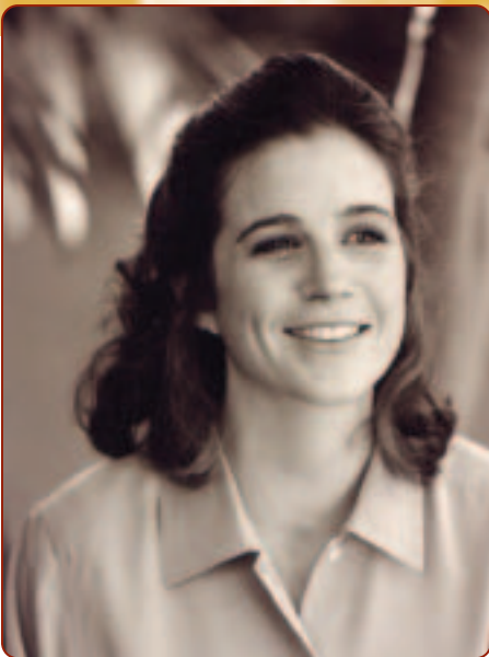
Tracy Droz Tragos