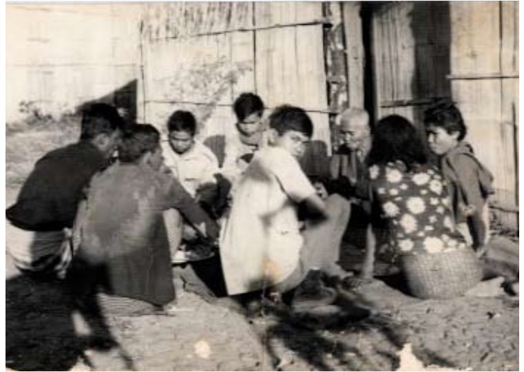
Many Uch in a Cambodian Refugee Camp

As part of efforts to tighten security in response to September 11, the U.S. government pressured Cambodia to change its policy. In March of 2002, the Cambodian government agreed to accept Cambodian refugees who were being forcibly deported. The agreement limits the number of deportees accepted each year, however, creating the delays experienced by people in the film. Currently, approximately 1,500 Cambodian Americans await deportation.