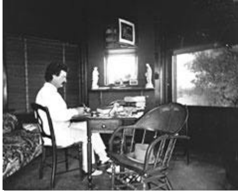
Mark Twain at the writing desk in his study at Quarry Farm in Elmira, NY, 1874