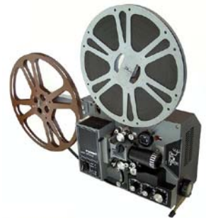
film reel and film projector

In the time before television was popular, people saw the news every week in their neighborhood movie theaters. Newsreels were shown before every movie. Universal Newsreel, produced from 1929 to 1967, was released twice a week. Each issue contained six or seven short stories, usually one to two minutes in length, covering world events, politics, sports, fashion, and whatever else might entertain the movie audience. 4 Newsreels became a primary source of disseminating the news visually.