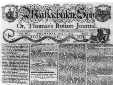
Massachusetts Sun, July 1774

While printing made the news in written form available to more people, there was still no fast way to disseminate news. The news could travel no faster than the person, animal, or sailing ship carrying it. In the early 1700’s the development of the steam engine added speed to transportation, making it possible to send news across oceans by steam-powered ships. Equally important, steam-driven printing presses caused greater numbers of books, pamphlets, and journals to be printed more quickly and affordably than ever before. Newspapers and magazines consequently grew in number and circulation, especially as people came to depend on them for news, information, and entertainment.