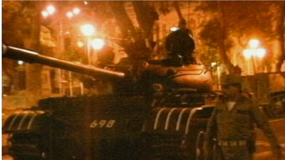
Fujimori stages a coup d'etat on April 3, 1992.

[Sources: www.dfat.gov, BBC News, New York Times , US State Department, NPS library]