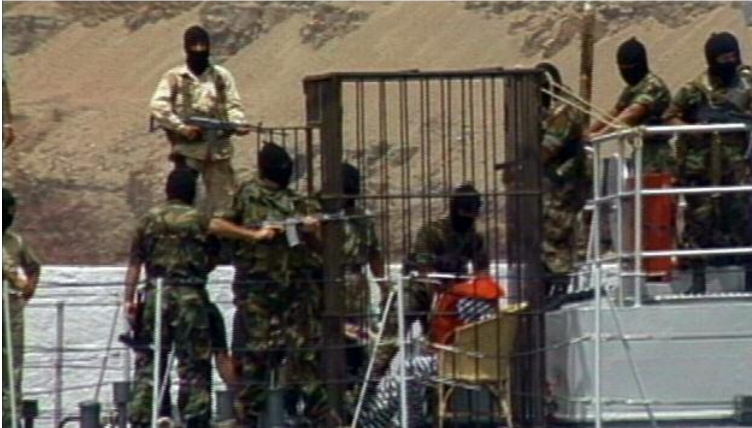
Abimael Guzman en route to Callao to serve out his life sentence.