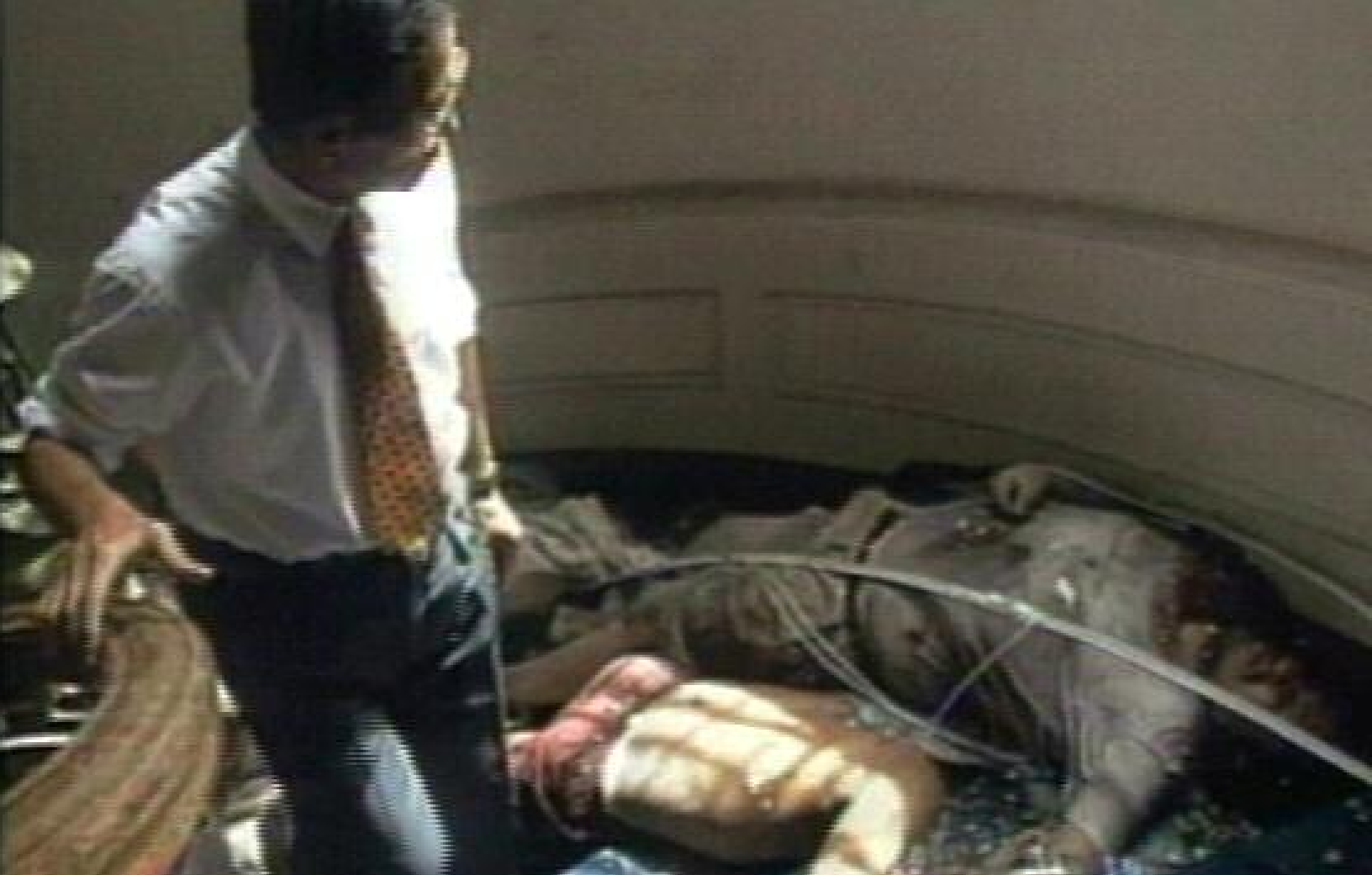
Fujimori looking at corpses in the Japanese Embassy.