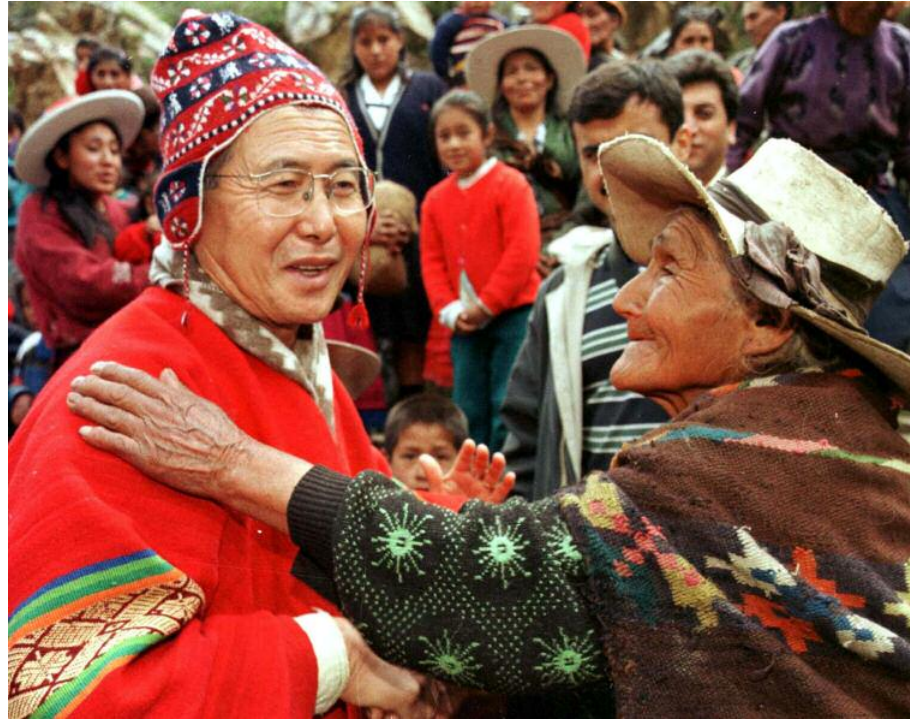
Fujimori in indigenous dress while campaigning for the 2000 elections.

Peru has significant mineral, metal and agricultural resources, as well as natural gas, but fluctuations in worldwide pricing of commodities have made it difficult to establish a strong, stable economy over long periods of time. The most recent government maintained control over inflation and oversaw