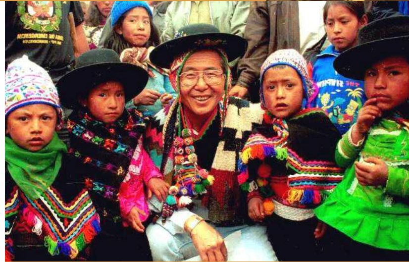
Fujimori in indigenous dress posing with Peruvian children.