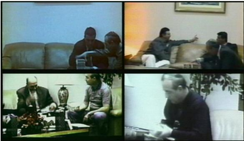
Videotape of Montesinos bribing a Congressman.