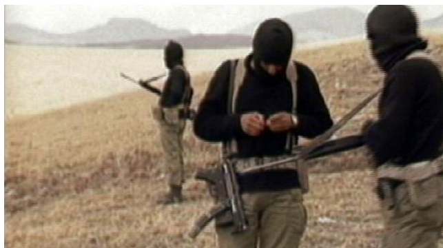
Death Squads.

• When congress refused to increase Fujimori's administrative powers, he conducted a coup and awarded himself more power. Fujimori claimed that it was necessary to take control in order to pass anti-terrorism laws immediately and protect democracy. In your view, how