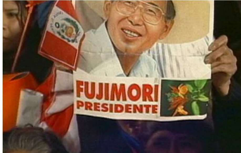
Fujimori election poster.

anything, do you admire about Fujimori? Do you think he served his country well as president? Why or why not?