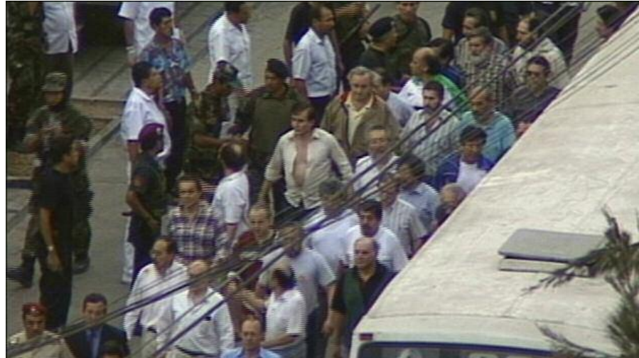
Hostages leaving the Japanese Embassy.

• Journalist Enrique Zileri says, "In violent times, the difference between terrorism and state-sponsored terrorism gets lost." In your view, is it necessary to use violence to respond to or prevent violence?