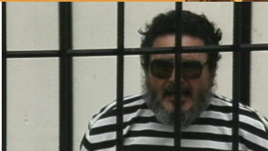
Abimael Guzman in jail.

December 17, 1996: The Tupac Amaru Revolutionary Movement (MRTA) takes over the Japanese Embassy. Four months later, Peruvian commando units storm the Japanese Embassy, rescuing all but one of the 72 hostages while killing every rebel.