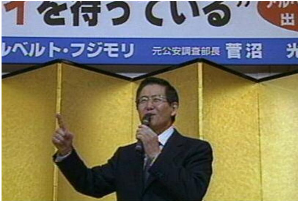
Fujimori in Japan.