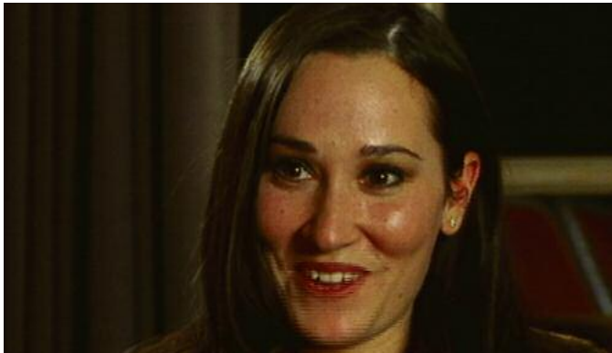
Meredith Eaton – actor