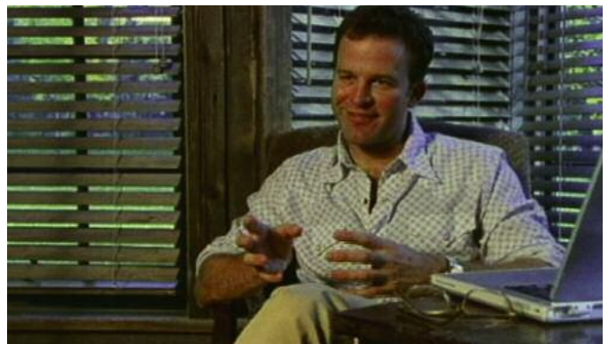
Tom McCarthy – writer and director, The Station Agent