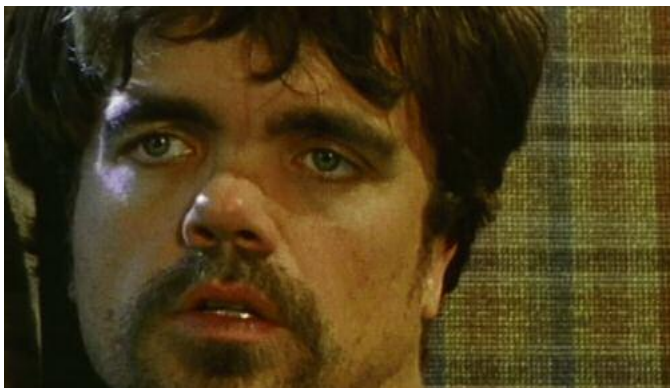
Peter Dinklage – actor