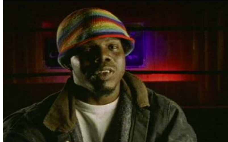
Rapper Bushwick Bill

Dwarfs or other people of short stature (either proportionate or disproportionate) come from all walks of life and ethnic backgrounds. Most people with dwarfism are born to average-sized parents with no history of dwarfism in the family. (For more information, visit www.lpaonline.org .)