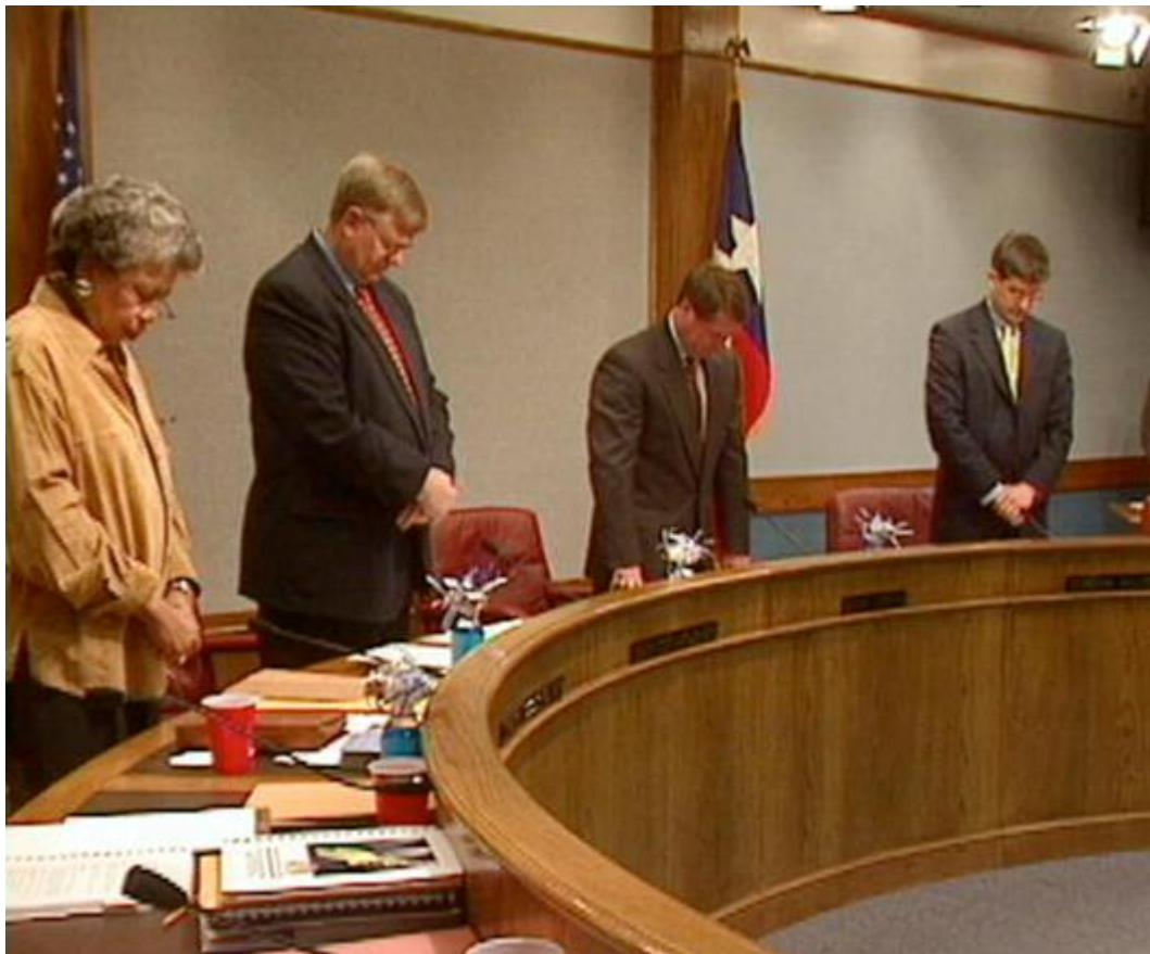
Lubbock School Board praying

Abstinence-only sex education is so named because it teaches that abstinence is the only sure way to prevent pregnancy and sexually transmitted disease, and that no other prevention strategies (like condom use or contraception) should be presented because such information encourages unhealthy or immoral behavior. The approach, advocated primarily by