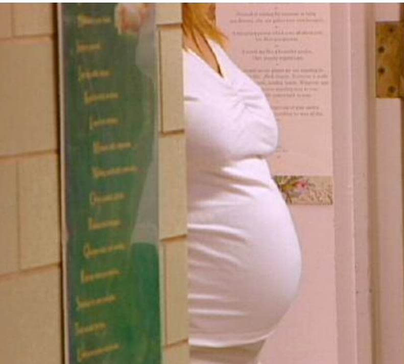
Pregnant student at Shelby's high school