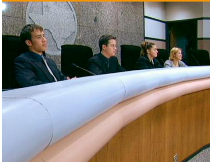
Lubbock Youth Commission meeting

Started by an OB/GYN at Scott & White Memorial Hospital in Texas, Worth the Wait® is an abstinence sex education program that promotes abstinence as the healthiest choice for adolescents. The program reaches over 100,000 students in more than 50 school districts in Texas and other states.