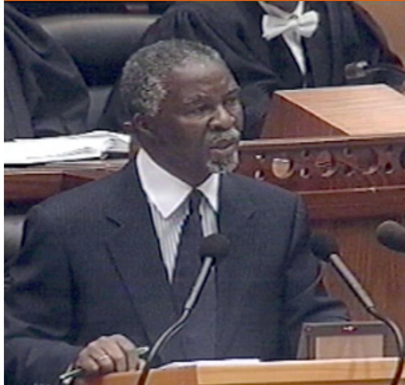
President Mbeki responds in Parliament to strong criticism of his HIV/AIDS policies.