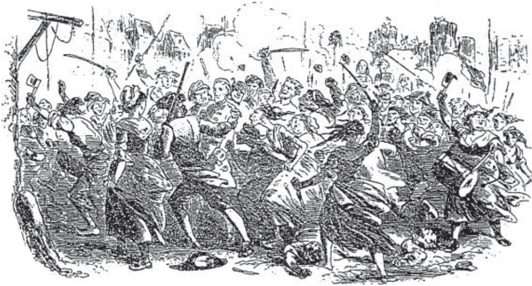
THE SEA RISES BY PHIZ (ORIGINAL ILLUSTRATION OF PARISIAN MOB FROM A TALE OF TWO CITIES, 1859)

The basic unit of meaning in written texts is the word. The basic unit of meaning in film is the shot (the frames produced by one continuous take of the camera, without cuts). Editing—how the shots are organized into a sequence—is what tells the story. The order in which shots follow each other is as important as the shots themselves. For example, imagine a sequence that begins with a shot of a woman and a man embracing. We understand from seeing this that the two people are attracted to each other, maybe even in love. But if this shot then cuts to a shot of someone secretly watching, and if that person is the woman’s husband, we have a whole new layer of information. If the camera then cuts to a close-up of his face and he is smiling rather than looking upset, the film goes in yet another direction.