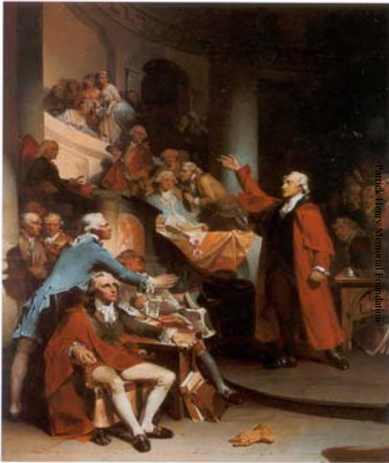
This is how an artist imagined Patrick Henry's 1765 speech against the Stamp Act to Virginia's House of Burgesses. On the floor in front he has thrown down a gauntlet—a glove—which is a traditional challenge to fight.

No man thinks more highly than I do of the patriotism, as well as abilities, of the very worthy gentlemen who have just addressed the house. But different men often see the same subject in different lights; and, therefore, I hope it will not be thought disrespectful to those gentlemen if, entertaining as I do opinions of a character very opposite to theirs, I shall speak forth my sentiments freely and without reserve. This is no time for ceremony.