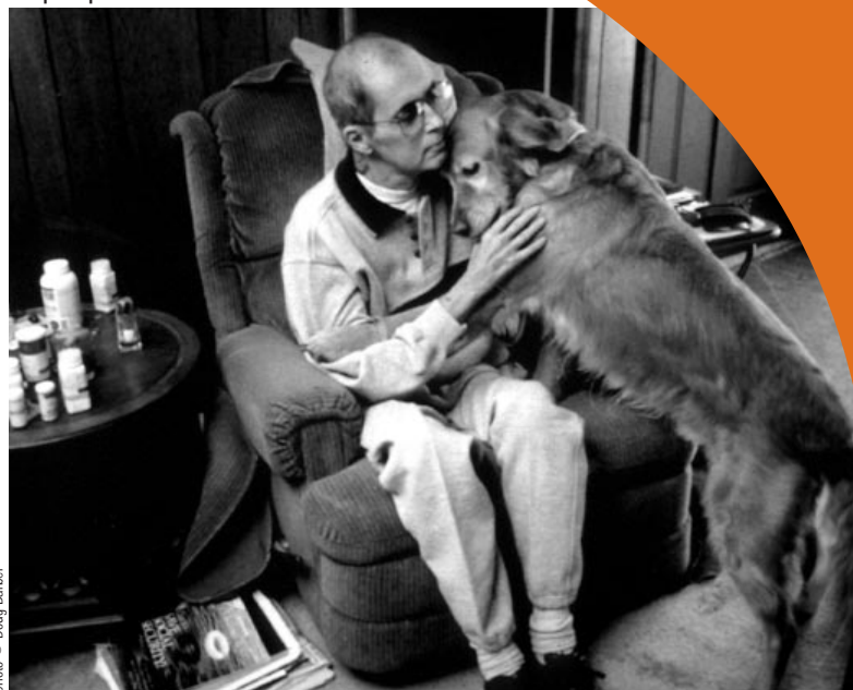
Hospice patient with friend

Faith communities can offer respite care, help with meals or childcare, or can provide comforting rituals. The friend or co-worker who anticipates a need is far better than the one who waits to be asked. Cut the lawn, buy the groceries, take the children to dinner, relieve the spouse. And during the final days, a friend or co-worker can provide the greatest gift imaginable: taking a simple course on how to become a hospice caregiver. Knowing how to help administer to a friend’s daily needs and relieve the family of duties provides a measure of peace not just for the patient, but for the friend who knows that she or he has done all that can be done to help provide a peaceful and painless end.