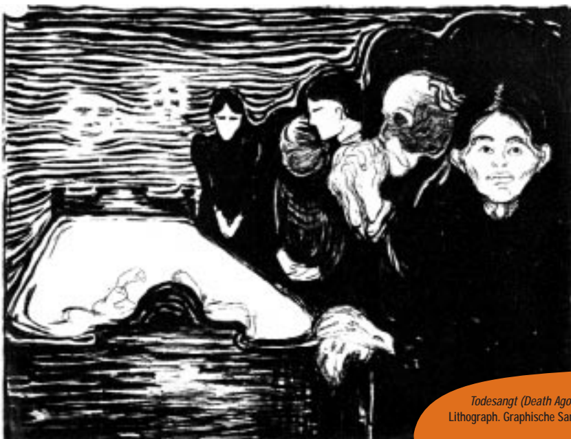
Todesangt (Death Agony) (1896), Edvard Munch. Lithograph. Graphische Sammlung Albertina, Vienna.

There is no timetable for grief. Each loss has a different meaning; a wide range of factors and circumstances affects each. Many individuals experience grief as a roller coaster, an uneven process full of ups and downs. Over time, many individuals will find that pain lessens and that they are able to return to previous levels of functioning. It is not unusual that even years following a loss, events or memories will continue to generate moments of grief.