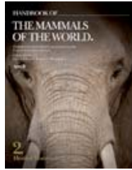
Volume 2: Hoofed Mammals