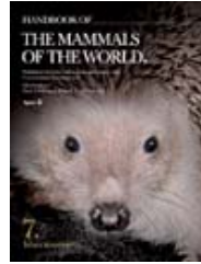
Volume 7: Insectivores