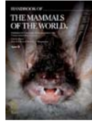
Volume 8: Bats