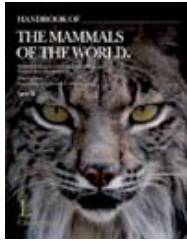
Volume 1: Carnivores