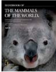
Volume 5: Marsupials