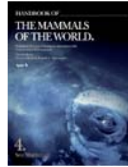
Volume 4: Sea Mammals