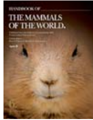
Volume 6: Rodents