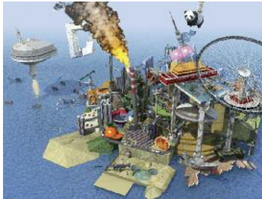
RMB CITY 4 , 2007. Digital C-print, 47 1/8 x 63 inches. © Cao Fei, courtesy the artist and Lombard-Freid Projects, New York