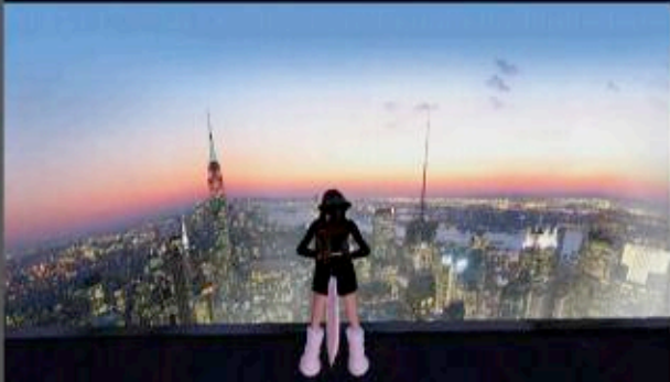
[12:17] Hug Yue: It's one that is dominated by youth, by beauty, and money.