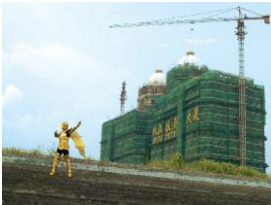
Golden Fighter (COSPLAYERS SERIES) , 2004. Digital C-print, 29 1/4 x 39 1/4 inches. © Cao Fei, courtesy the artist and Lombard-Freid Projects, New York